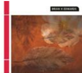
Grace— amazing Grace