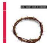
The Divine Substitute The atonement in the Bible and history